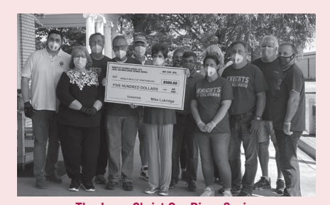
The Jesus Christ Our Risen Savior Knights of Columbus

Due to the stay at home order issued early on and the risk factors involved for seniors, many of our faithful volunteers could not deliver. The Lord provided in an incredible way as several churches asked how they could help. NewSpring Church, Anderson Mill Baptist Church and The Jesus Christ Our Risen Savior Knights of Columbus, amongst many individuals came to help with meal deliveries. We owe each of those represented a debt of gratitude! We could not fulfill our meal delivery efforts without assistance of our community.